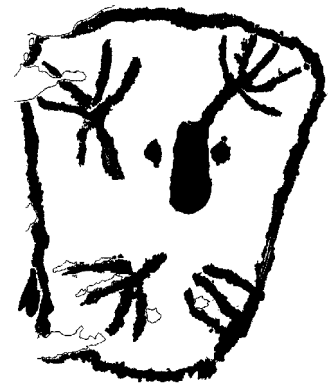
Shoshone water ghost, or pa:unha